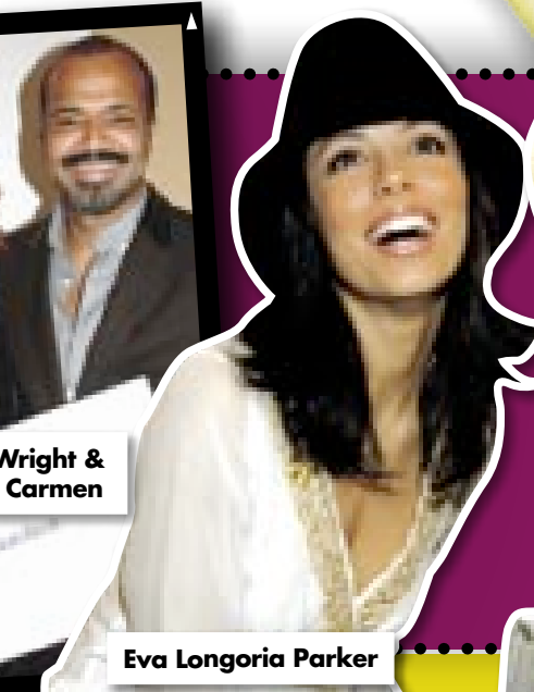
Eva Longoria Parker