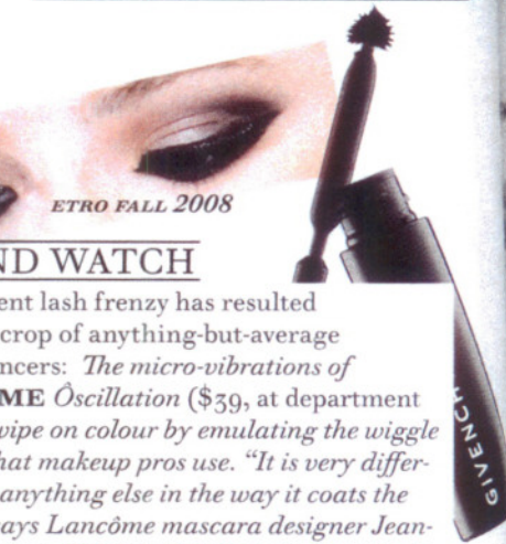
ETRO FALL 2008

MAYBELLINE ladies ADRIANA LIMA , KEMP MUHL (above), JESSICA WHITE , JULIA STEGNER and ANNA WANG all struck a pose for a limited-edition 2009 calendar. Only 1,200 copies are being produced, and we're giving five to FASHION readers who wrote letters to the editor this month (see page 36).