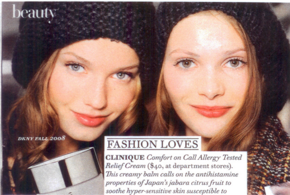
DKNY FALL 2008